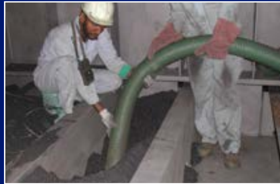
▶ Grit Suction

The team is a hand-picked group of dedicated professionals from around the world, with a wealth of international experience between them in all types of corrosion control/blasting/painting in Bahrain, the Gulf and Europe.