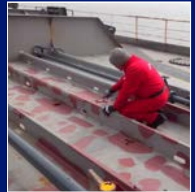
► Bridge Deck Water Proofing