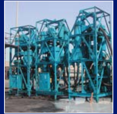
▶ Grit Recovery Unit.