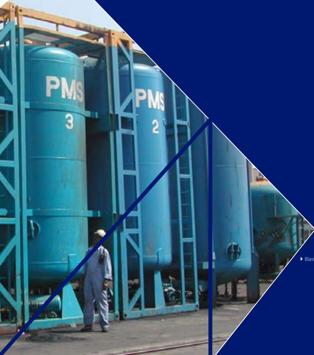
▶ Blast Hoppers.