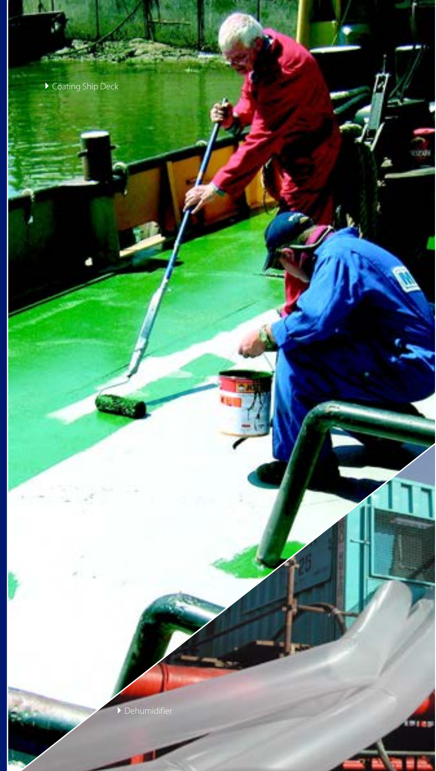
▶ Coating Ship Deck