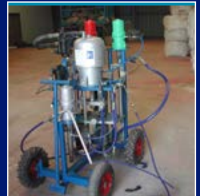
► Dust Free Track Blasting Equipment