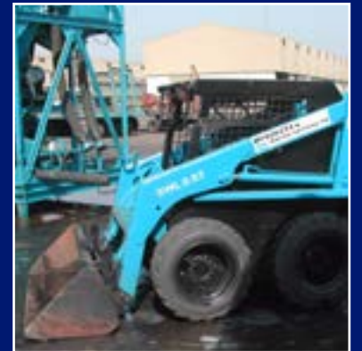
▶ PMIS Heavy Machinery