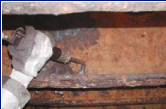
▶ Tank Prior to Treatment