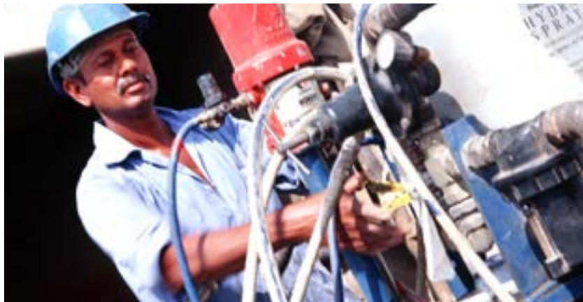
▶ Automatic Dust Free Blasting Chamber.