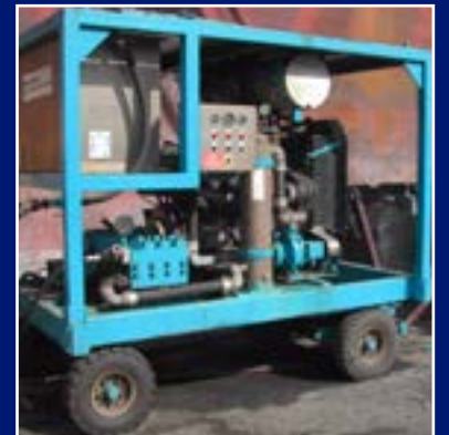
▶ High Pressure Washing Machines