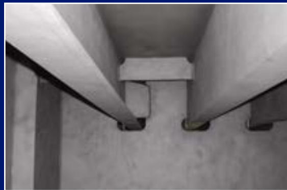
▶ Tank After Treatment