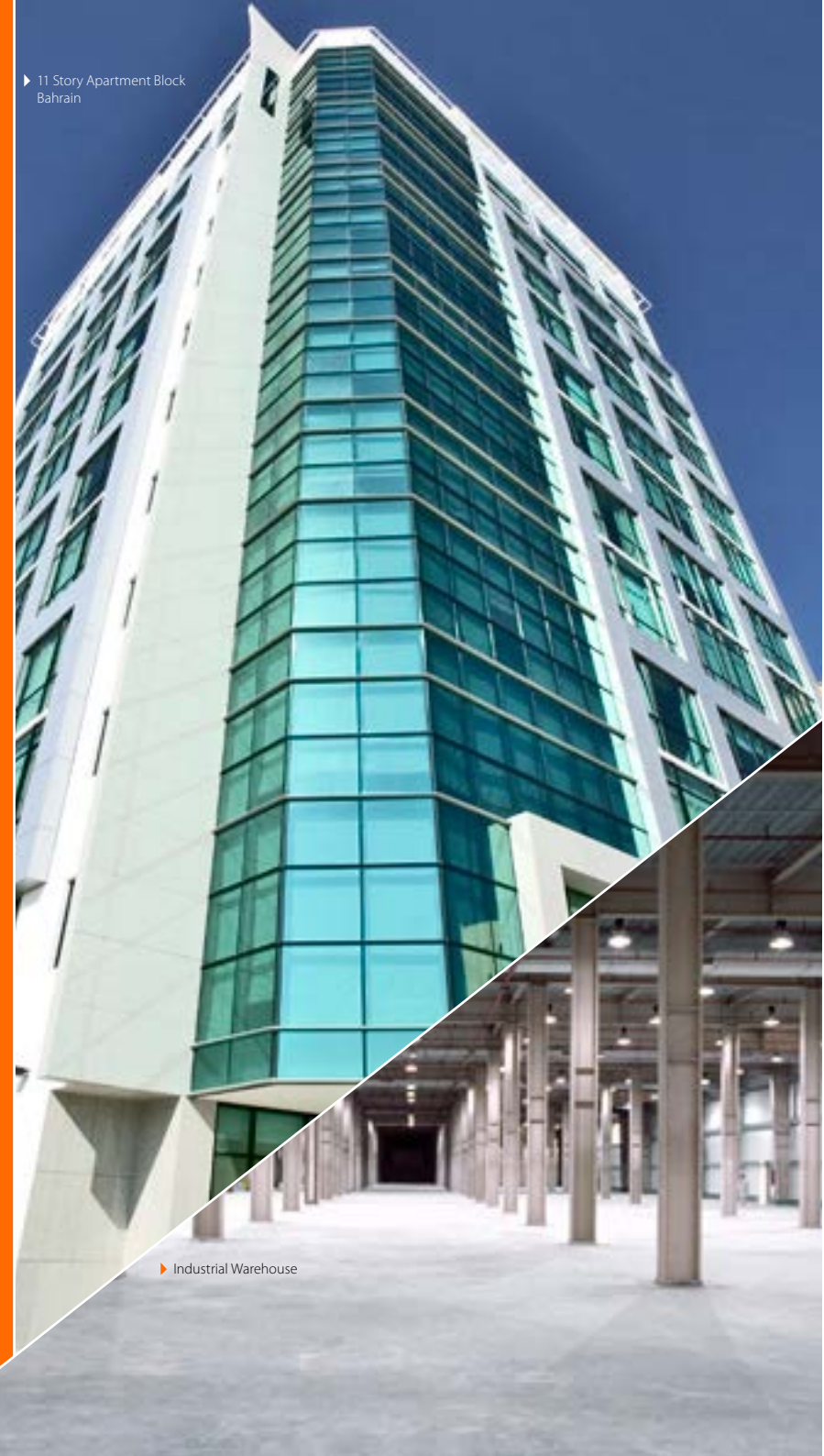
▶ 11 Story Apartment Block Bahrain

The company works throughout the retail sector constructing highly serviced shopping complexes as well as fitting out individual shop units. Several major distribution warehouses have been constructed as part of the complex distribution networks which support modern retailing.