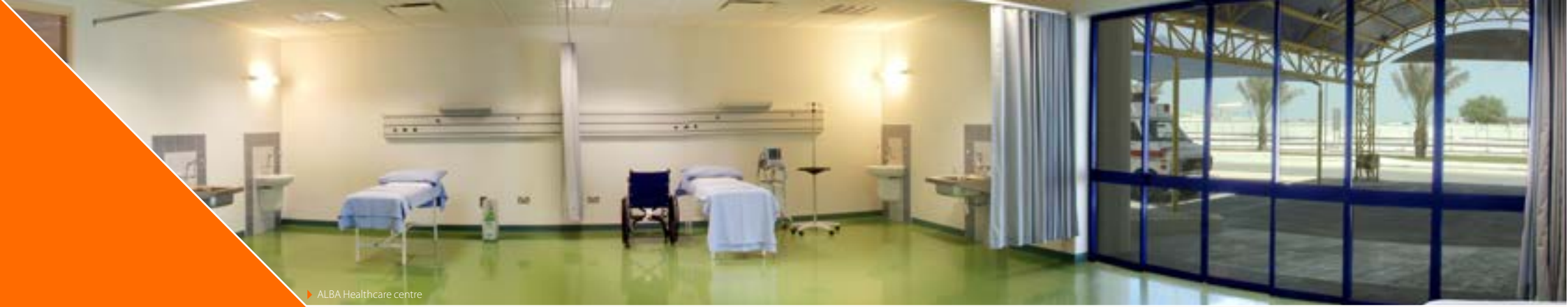
▶ ALBA Healthcare centre