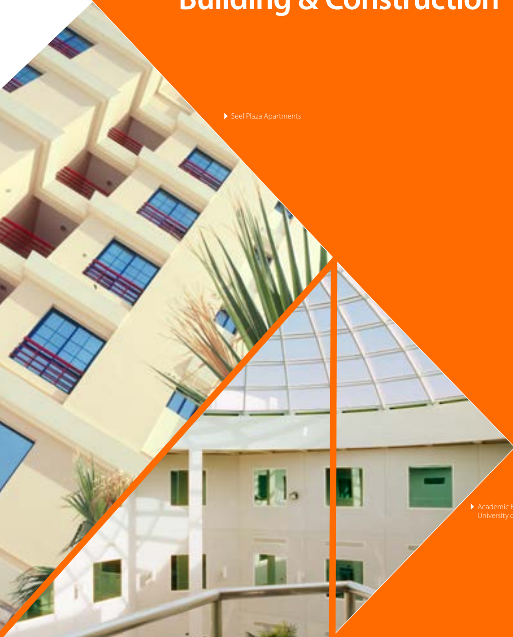
► Seef Plaza Apartments