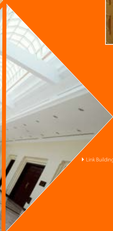
► Link Building Bahrain Exhibition Center