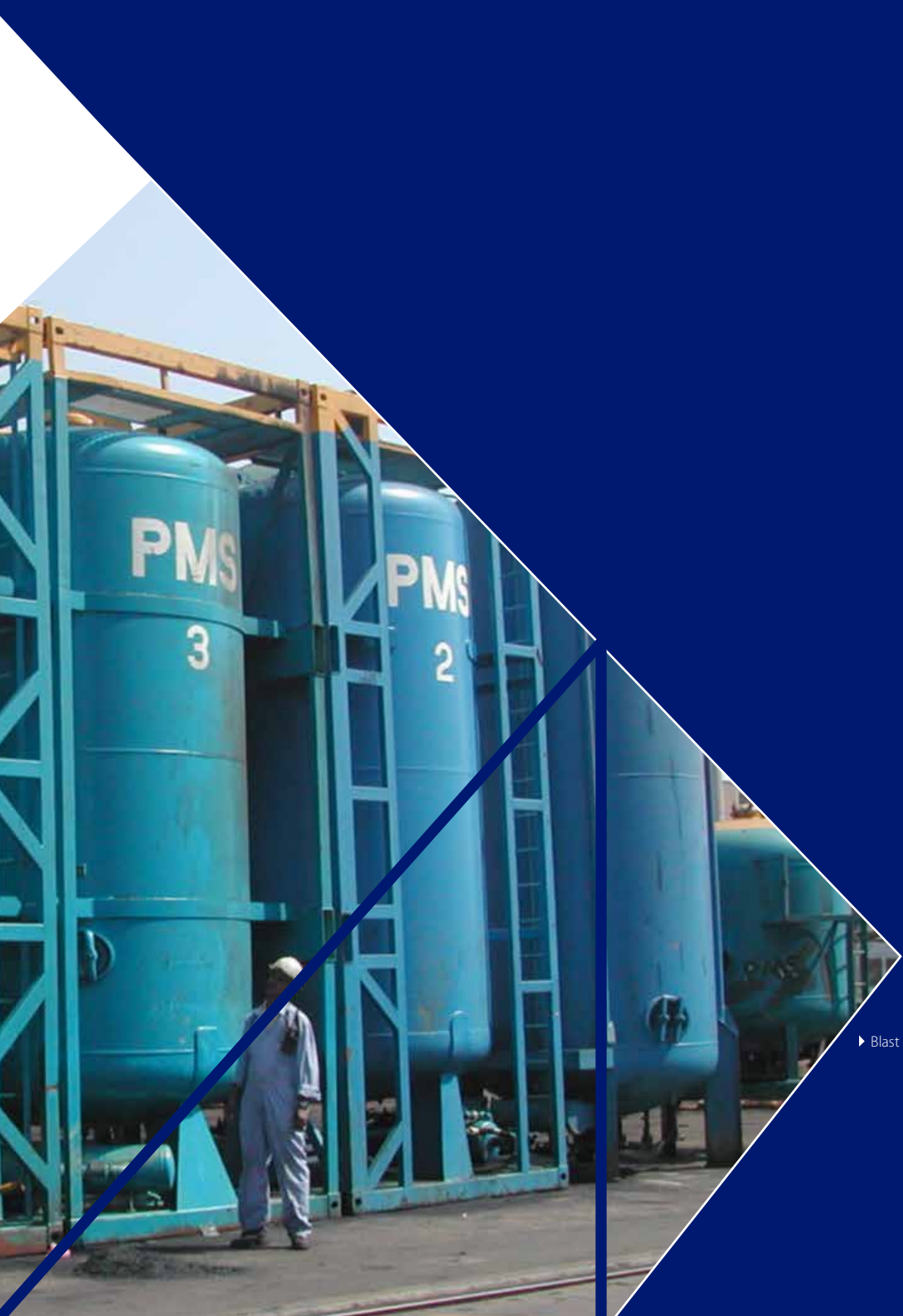
▶ Blast Hoppers.