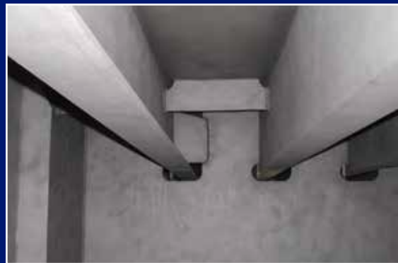
▶ Tank After Treatment