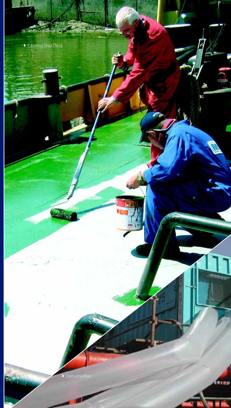
▶ Coating Ship Deck