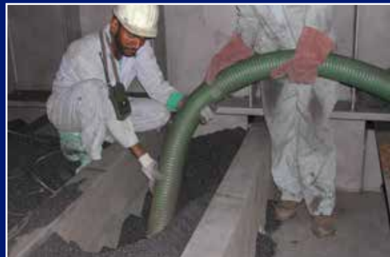
▶ Grit Suction

The team is a hand-picked group of dedicated professionals from around the world, with a wealth of international experience between them in all types of corrosion control/blasting/painting in Bahrain, the Gulf and Europe.