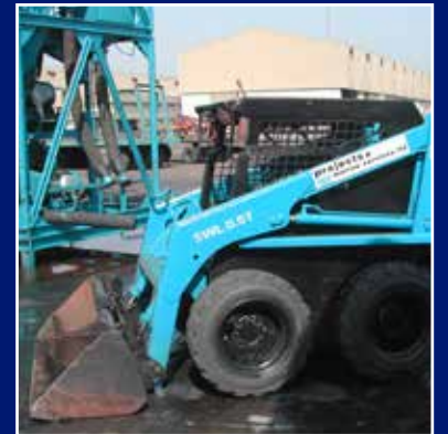
▶ PMIS Heavy Machinery