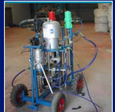
▶ Dust Free Track Blasting Equipment