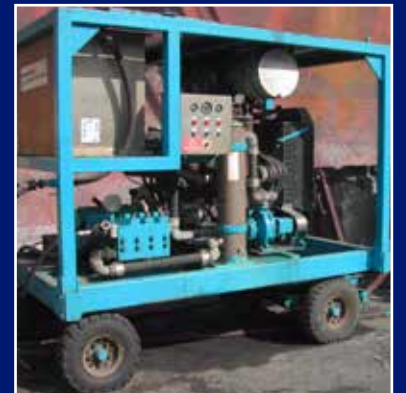
▶ High Pressure Washing Machines