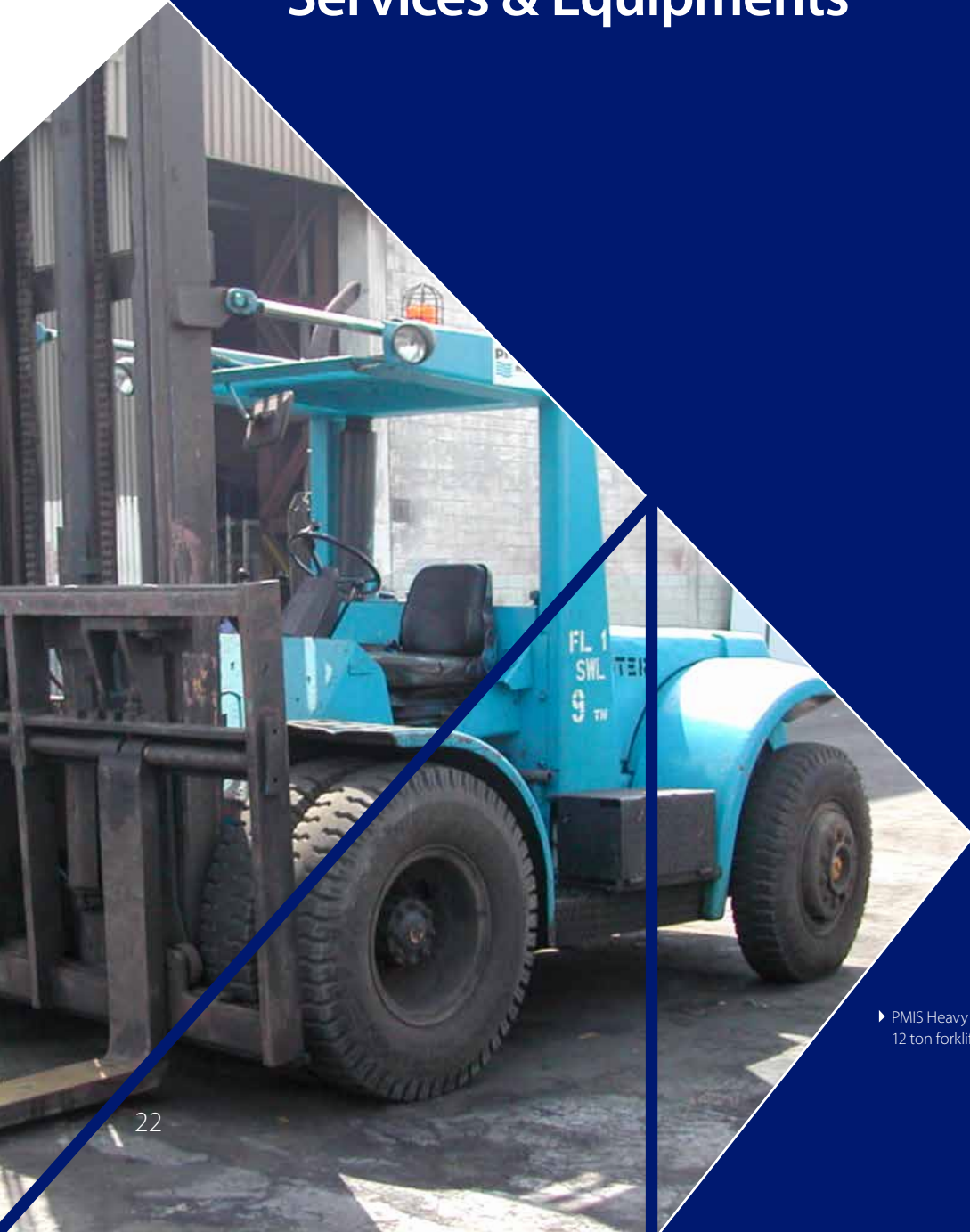
▶ PMIS Heavy Machinery 12 ton forklift