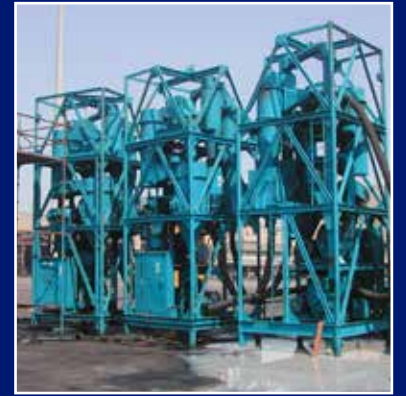
▶ Grit Recovery Unit.