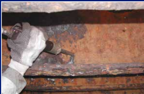
▶ Tank Prior to Treatment