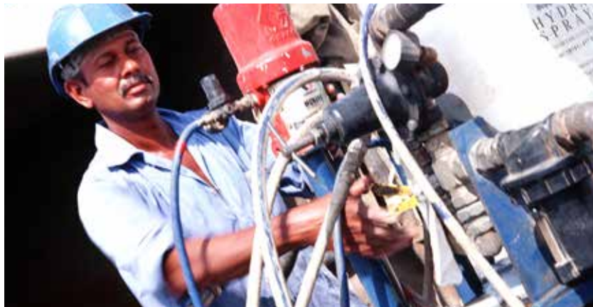
▶ Automatic Dust Free Blasting Chamber.