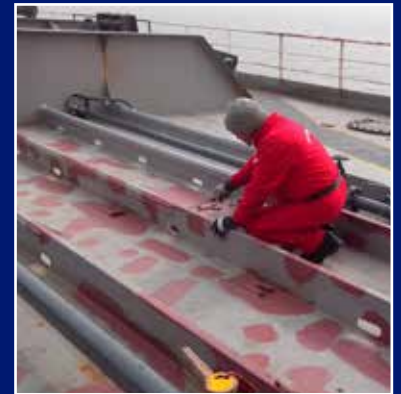
▶ Bridge Deck Water Proofing